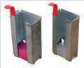
Medical alert tags & dog tags