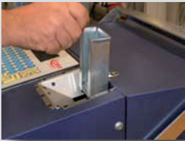
Interchangeable input hoppers for dog tags and medical alert tags for easy change