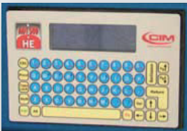
Integrated standard keyboard