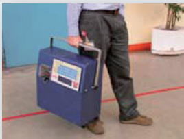
Easy to carry handle